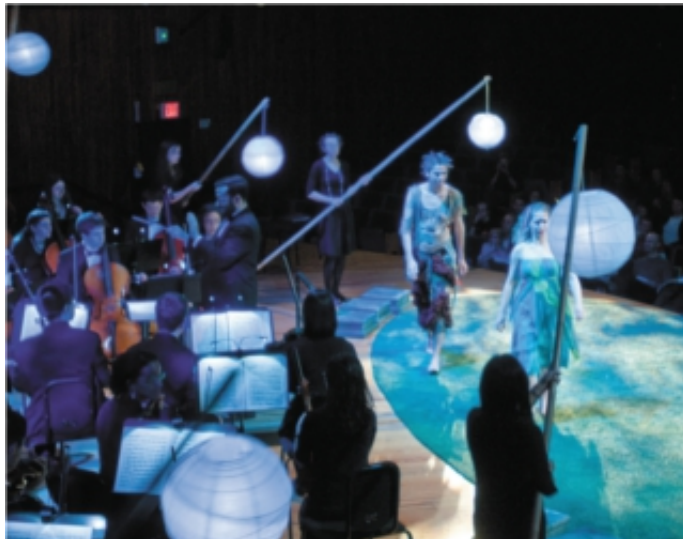
Student actors, singers, and musicians from MIT share the stage in A Midsummer Night's Dream , performing text by William