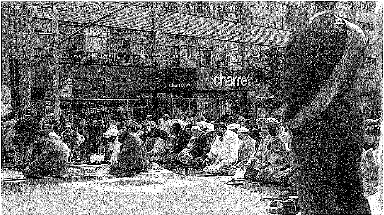
Figures 6.1 and 6.2. The Muslim World Day Parade: Lexington Avenue and Thirty-third Street transformed into an outdoor mosque.