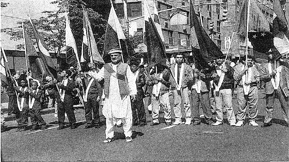
Figure 6.3. The Muslim World Day Parade: Opening parade of flags headed by the Afghan community leader.

national day parade; and on the other hand, there are representations of mosques, those solid architectural structures that usually signify permanently occupied places. The mosques are cardboard and papier-mâché representations of Jerusalem's Dome of the Rock and the Black Stone, or Kaaba, of Mecca; they float down Lexington Avenue as emblems of the New York City Muslim community. I recall that the floating Kaaba provoked an exclamation of wonder from a bystander who was unknown to me. He exclaimed, "Only in America," and then said there is an Islamic tradition that only at the end of days would the Kaaba become unmoored from Mecca and float freely.