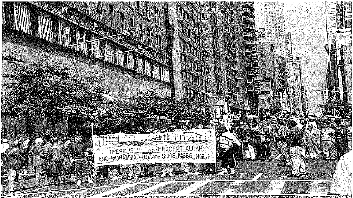
Figures 6.4 and 6.5. The Muslim World Day Parade: Texts and organizations.