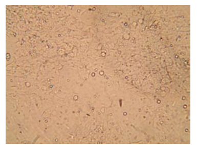
Plasmid + Experimental siRNA

Cells transfected with either siRNA, plasmids, or both appear to exhibit less dense growth compared to cells that were not transfected with nucleic acids. These images were taken 48 hours after transfection at 10x magnification.