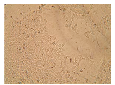
Plasmid + Validated siRNA