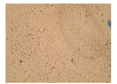
No Plasmid, No siRNA

Figure 2. The transfection of siRNA or psiCHECK2 plasmid into mouse embryonic stem cells leads to minor growth inhibition.