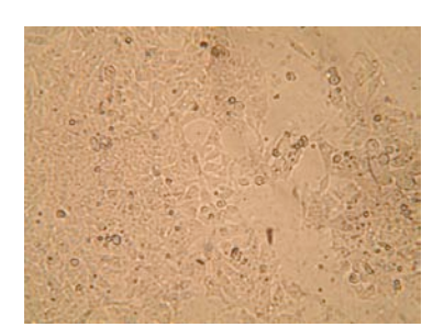
Plasmid + Scrambled siRNA