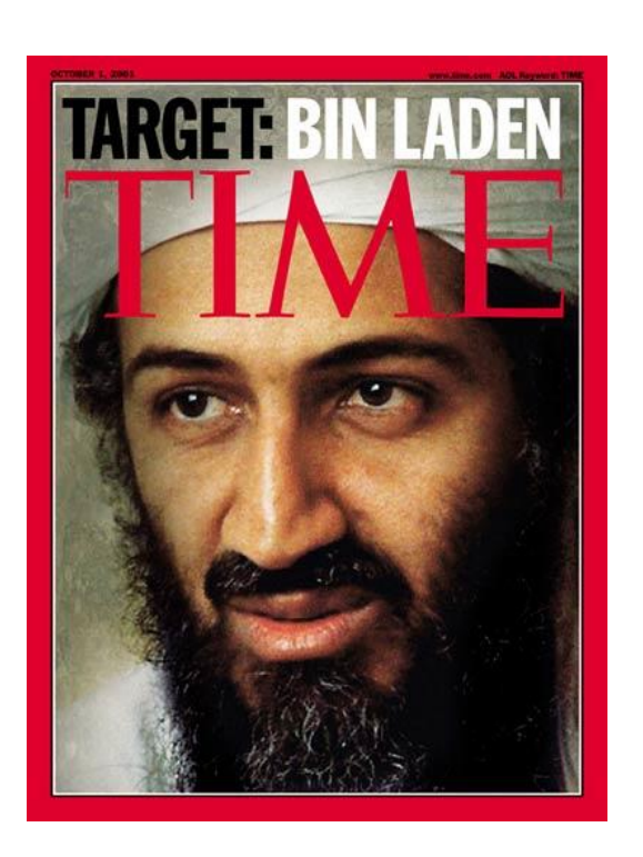
© TIME. All rights reserved. This content is excluded from our Creative Commons license. For more information, see <a href="http://ocw.mit.edu/help/faq-fair-use/">http://ocw.mit.edu/help/faq-fair-use/</a>.