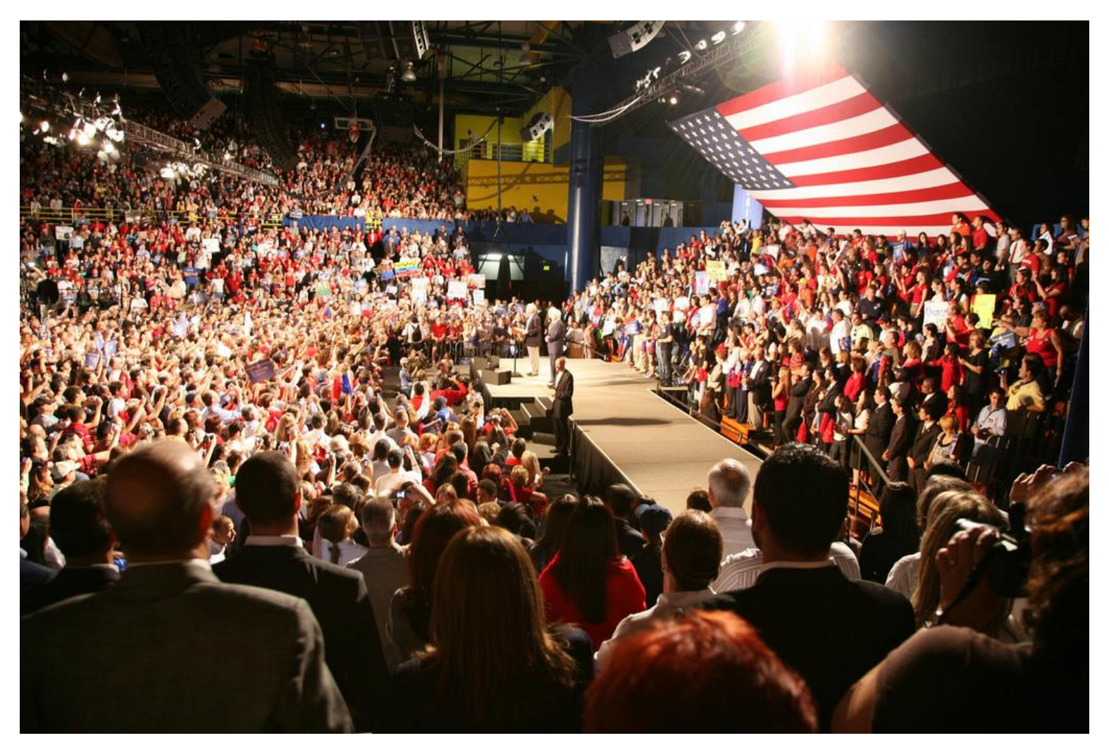
Courtesy of EL Gringo on flickr. Used with permission. License CC-BY-NC-SA.