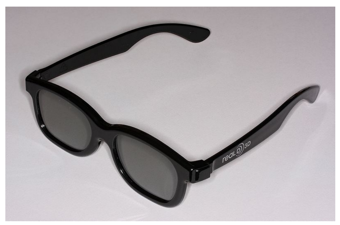
Figure 3: A pair of Real D 3D glasses. © D-Kuru/Wikimedia Commons. CC BY-SA. This content is excluded from our Creative Commons license. For more information, see http://ocw.mit.edu/fairuse.

3. You are given a pair of Real D 3D glasses. Determine which eye has the right-handed circular filter, and which eye has the left-handed circular filter. You will have access to two waveplates (a half-wave plate and a quarter-wave plate) specified for 532 nm, but it's up to you to figure out which is which.