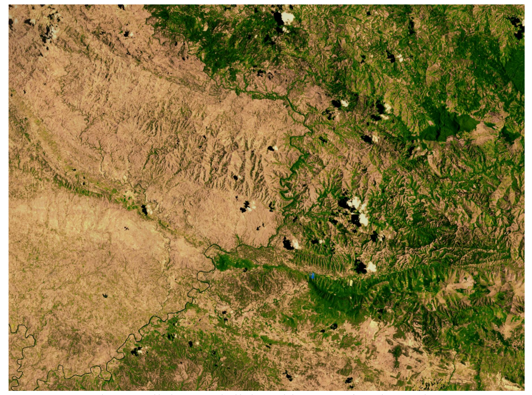
The image is public domain. NASA/Goddard Space Flight Center Scientific Visualization Studio.