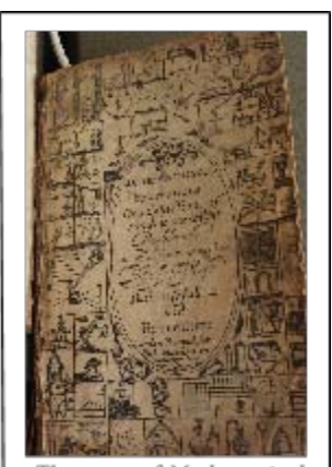
The cover of Mathematical Recreations was filled with diagrams, probably in order to entice potential readers.

admirable conclusions" (Leurechon, Mathematical Reflections , cover). The cover appealed to a wide audience, depicting the range of topics touched on in the book and calling them "useful and recreative." Also to appeal to a layperson, Leurechon made a point of omitting detailed, technical explanations for the problems, stating in the introductory "By way of advertisement" section, "Those which understand the mathematics can conceive them easily; others for the most part will content themselves only with the knowledge of them" (Leurechon, Mathematical Reflections , "By