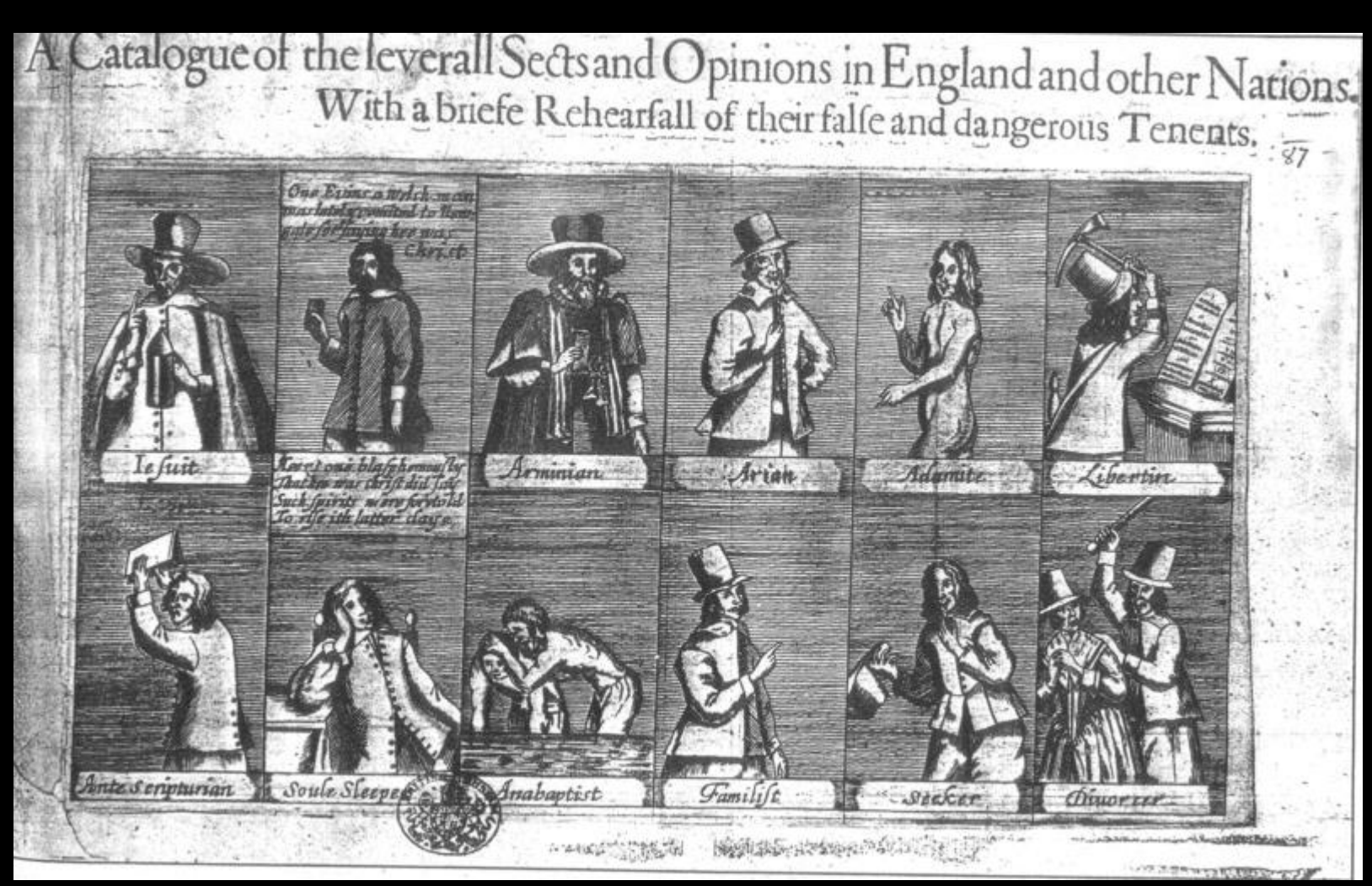
This image is in the public domain.