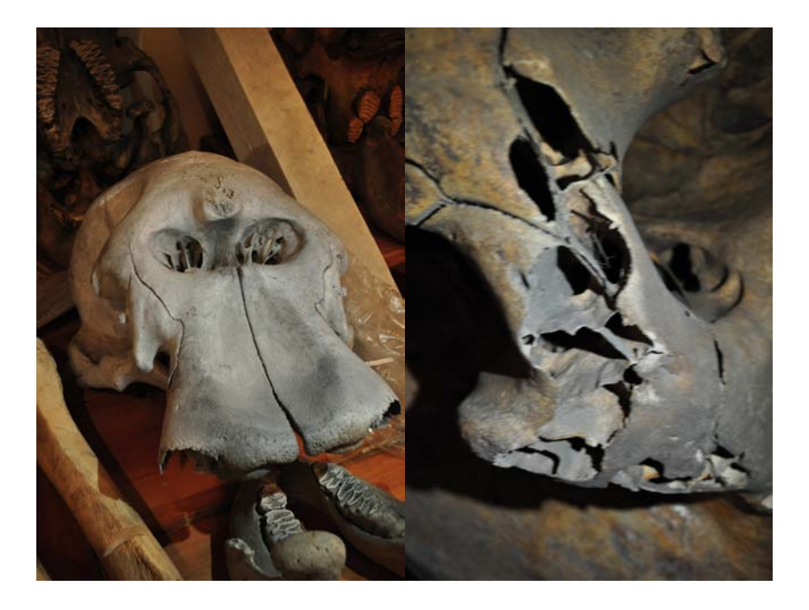
Figure 1: An adult Elephas maximus skull from the Harvard MCZ's collection, and a close-up of honeycomb bone structure behind the eye socket.

Prior to experimentation, our project began with a visit to the Harvard Museum of Comparative Zoology to investigate Elephas maximus skulls in the museum's collection. Professor Gibson and Nina examined and photographed several adult Asian elephant skulls, taking note of the unique honeycomb bone structure within. The animal's cranium showed especially prominent interior cavities in the rear and forehead, the latter of which is especially consistent with infrasound reception. Figure 1 shows a full adult Elephas maximus skull from the museum collection, and a closer view of the honeycombs.