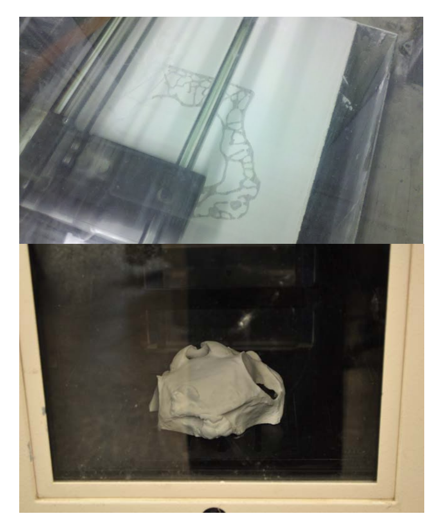
Figure 3: An Elephas maximus cross-section being rendered in the 3D printer, and the Tursiops truncatus skull being waxed during post-processing.

The skulls were fabricated using a Z Corporation Spectrum 3D printer; the apparatus renders geometrically complex objects using a blend of water, HP ink, and polymer solution to solidify a polymer-blended gypsum powder. After printing, the models were cleaned using a small paintbrush and a pen-sized air jet, and subsequently infused with wax to reduce brittleness; Figure 3 presents a glimpse of the manufacturing process for both skulls. While the Tursiops truncates skull was printed in full (minus the jaw and teeth), the Elephas maximus skull was printed in three layered pieces to reduce the risk of collapse from the weight of excess powder inside.