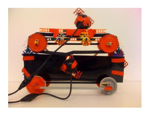
Figure 3: Rear view of the prototype

As the vehicle moves, the top camera is motion-cancelled, and the bottom webcam moves twice as fast. As the chain turns, the cameras move horizontally and then switch sides. In order to always output from the non-moving camera, there is black mask on the lower half of the vehicle, blocking the current lower camera from seeing anything. The software is programmed to choose the camera input that is not blacked out.