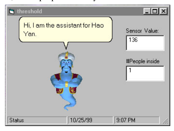
Figure 2: Office Assistant Agent

The visitor detector consists of two pressure-sensitive mats placed on both side of the office door. They are connected to the same parallel port of the computer outside the office. Both mats are big enough so that it is hard not to step onto them in sequence when a person enters or leaves the office. By detecting the state changes of the mats, the agent is able to figure out whether the person is entering, exiting, or standing on the threshold, and to keep track of the number of people in office. The two mats look similar to normal carpets, so that people will likely not notice the sensors.