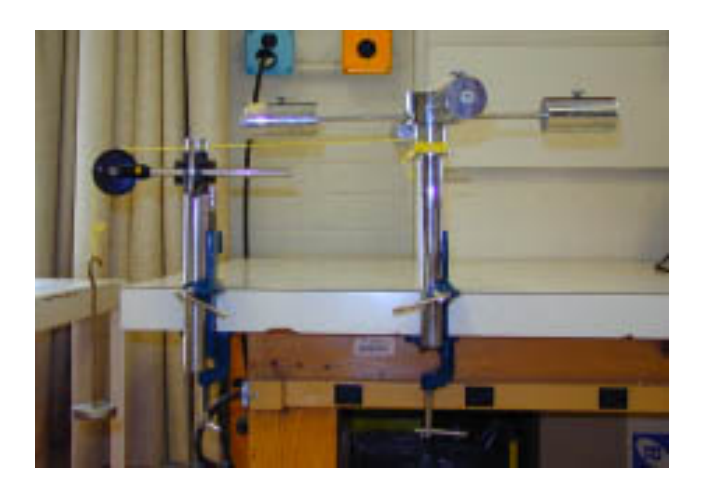
Question 3: Chrome Inertial Wheel: A fixed torque is applied to the shaft of the chrome inertial wheel. If the four weights on the arms are slid out, the component of the angular acceleration along the shaft direction will