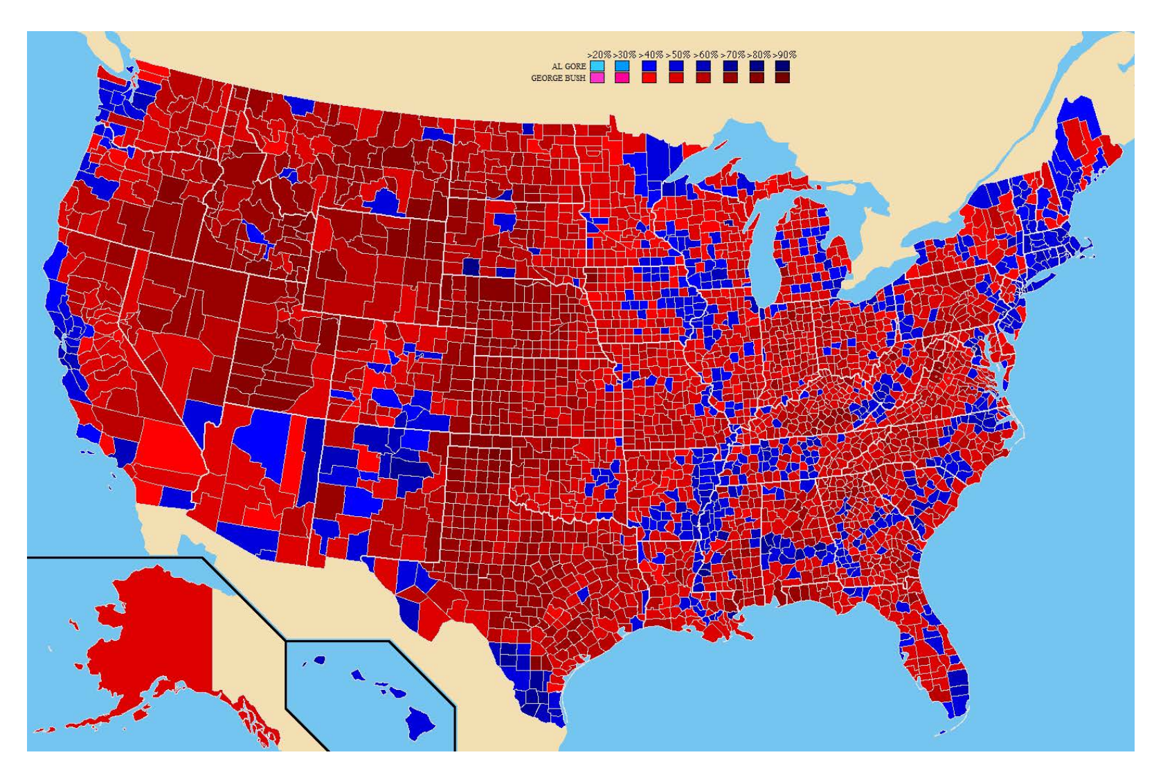
Courtesy of Tilden76 on Wikipedia at http://commons.wikimedia.org/wiki/File:2000prescountymap2.PNG. License CC BY 3.0