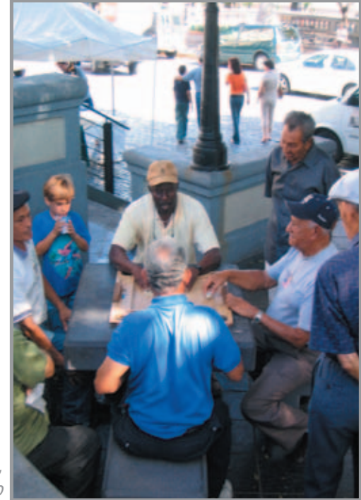
Domino players and spectators, San Juan, Puerto Rico

The second scenario involves shifting all Chestnut School parking to the larger northern area of the Chestnut School parking lot. All